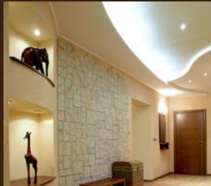
Light Cove Moulding